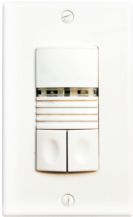
SL-308D-12US / SL-308D-24US