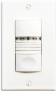
SL-308S-12US / SL-308S-24US